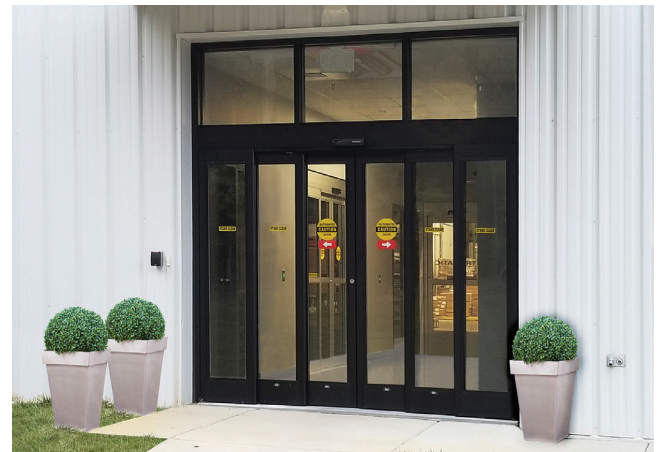
DS20 telescopic in dark bronze

Technical data subject to change without notice.